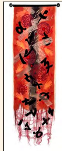
The Artist's Hand